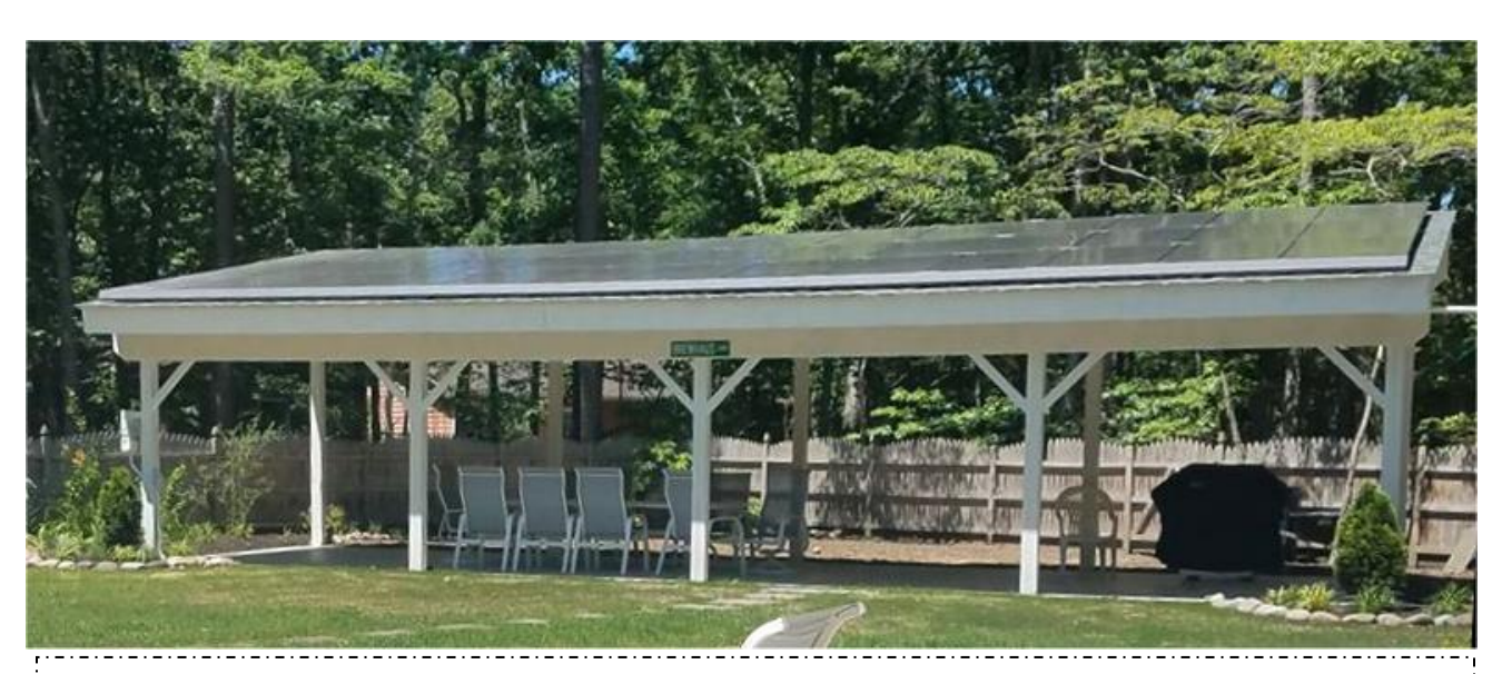
Example of what the canopy could look like