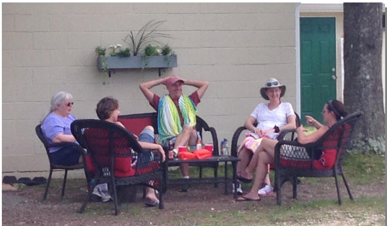
Murray Grove 2016

Where the Hutchisons go, a good time is sure to follow!